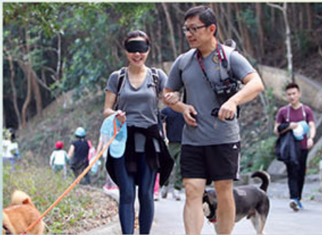
參加者蒙眼步行，體驗視障人士利用其他感官探索環境 Participants put on blindfolds to experience walking without sight and empathise with the visually impaired.