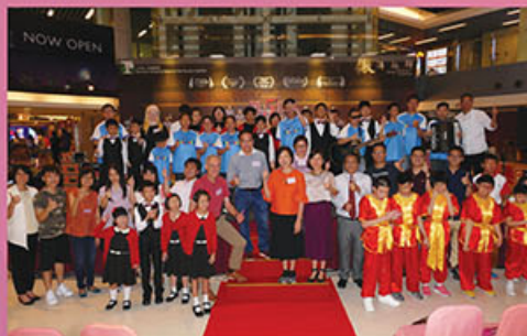
導演楊紫燁、心光董事、校友及表演學生齊上台支持 Director Ruby Yang, board members, alumni and performing students all show support onstage!