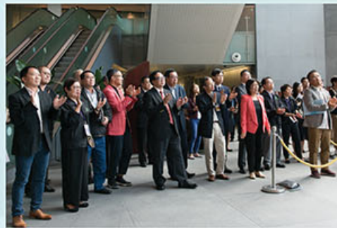
表演吸引了多名立法會議員駐足欣賞 LegCo members greatly enjoyed our students' performance