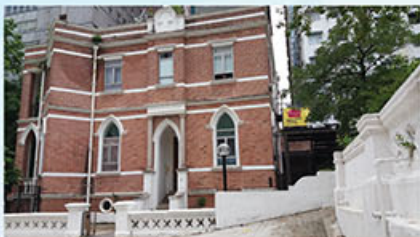
聖安德烈堂的舊牧師樓 Old Vicarage of St. Andrew's Church

衷心感謝尖沙咀聖安德烈堂以相宜的價錢租出一個房間，讓我們可以於今年7月中旬開始，為較偏遠地區或多重弱能的視障幼童提供一個交通方便的訓練點。