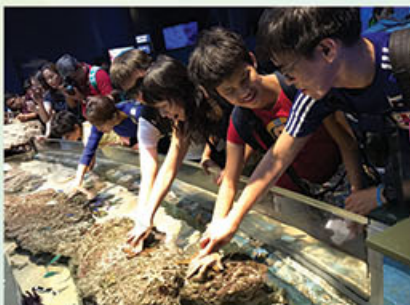
於水族館觸摸海星 Visiting the Aquarium