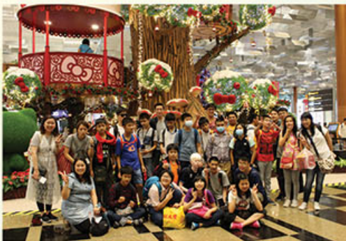
新加坡樟宜機場合照 Having our last group photo before we say goodbye to Singapore