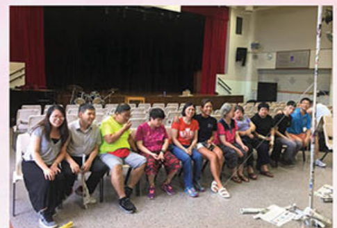
看！我組的紙旗桿最高。(校友夏令營) Take a Look! Our Team set the highest paper flagpole. (Alumni Summer Camp)