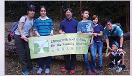
傷健家庭喜凝營活動 A 3-day-2-night camp @Fei Ngo Shan