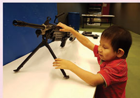
暑期活動—射擊體驗 Summer activities—shooting experience