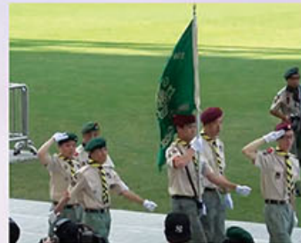
參與香港童軍大會操 @HK Scout Rally