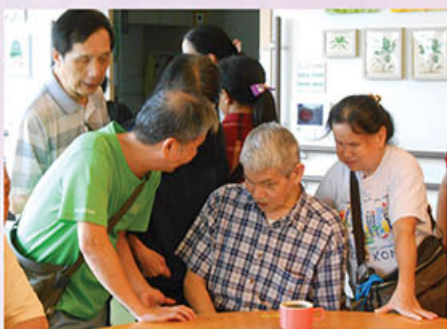
校友探訪-彼此關顧 Alumni Visit- Caring for each other