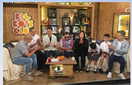
心光實驗樂團於無綫Big Boys Club接受訪問 NOIR Music members @interview at TVB J2