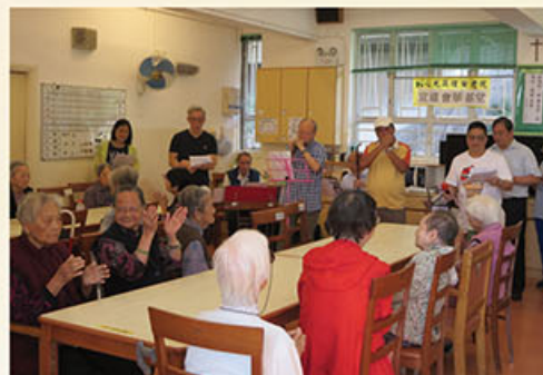
義工為院友們演奏樂器 Musical instrument playing