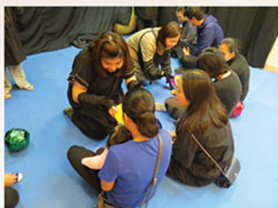
「視障朋友I SEE U」到校講座 "I SEE U" Talk for Kindergarten