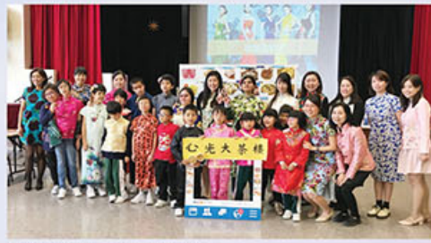
齊穿華服@中華文化週 Costume Catwalk@Chinese Culture Week