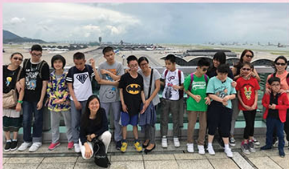
參觀香港國際機場航空教育徑 Visit to the education path at the Civil Aviation Department Headquarters, HK International Airport