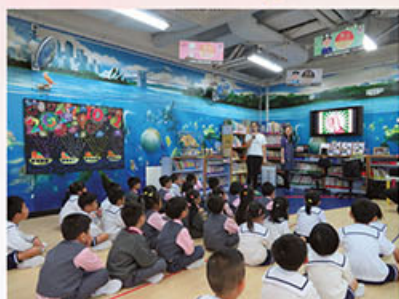
EIP CVI 工作坊 EIP CVI Workshop