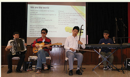
校友音樂人傾力演出 Performance by alumni musicians