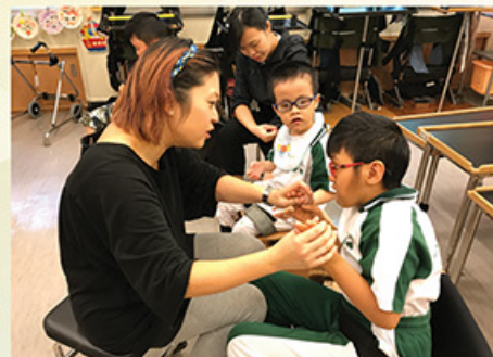
音樂導師與視聽障學生以觸感手語感受歌曲的意思 Music group tutor introducing the song to deaf-blind student with tactile sign language