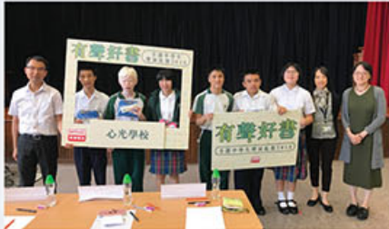
香港電台有聲好書比賽 RTHK audiobook competition