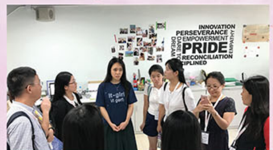
接待國內社服界訪港團 Receiving mainland guests from the social service sector