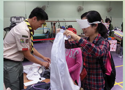
自理技能挑戰賽：「向左穿？向右穿？」 Self-care Skills Challenge: Left or Right firstly?