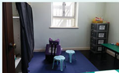
市區訓練點的訓練房間 Training room of the town centre