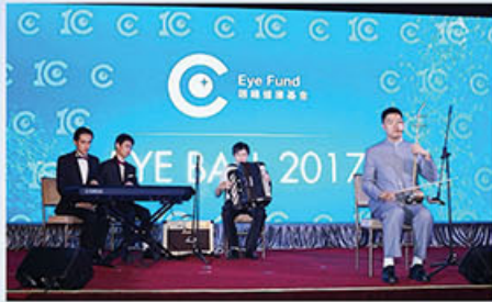
音樂表演@眼睛健康基金 Music Performance at 10th Anniversary Ball of Eye Fund