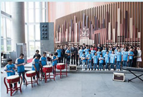
同學傾力演出，以音樂牽動全場氣氛 Everyone was invigorated by the beautiful music performance of students

感謝立法會秘書處的安排，讓心光學校和心光恩望學校的同學，以及心光實驗樂團的成員可以到立法會表演及參觀。到達後，我們隨即到飯堂用膳，然後便進行綵排。由於時間有限，只綵排了一會便開始表演了。幸好，同學們平日勤於練習，表演非常順利，在場多位立法會議員和職員們掌聲如雷。表演完畢後，同學們更有機會與立法會議員聊天，隨後也有幸到議事廳等地方參觀，期間同學們積極發問，非常投入活動。