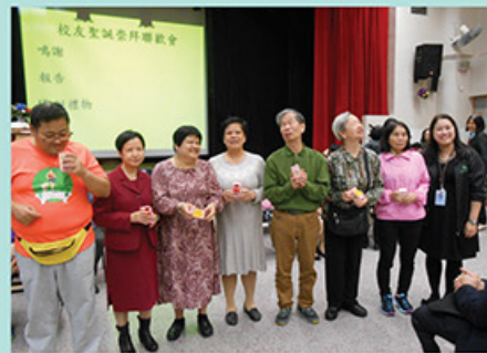
他們從不間斷出席了16年 They have attended our Christmas Worship Service for 16 consecutive years