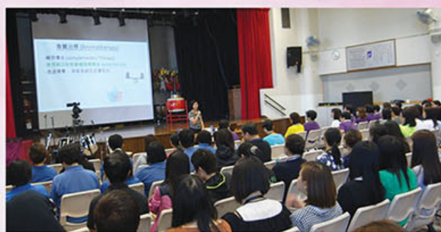
職員培訓—香薰治療 Staff Development Program on Aromatherapy