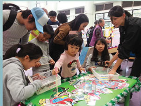
「我的手眼協調很好！」 "My eye-hand coordination is very good."