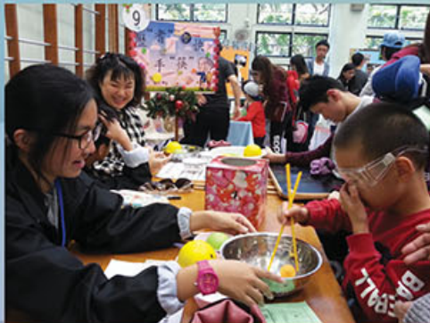
2 手“筷”快夾波仔，我最快！ "I can catch the ball quickly."

共融參與心光聖誕嘉年華，洋溢一片歡樂氣氛 ALL are welcome to Christmas Carnival