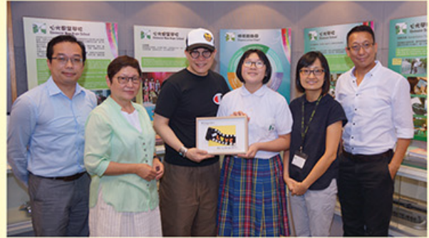
Famous artiste William So visits Ebenezer