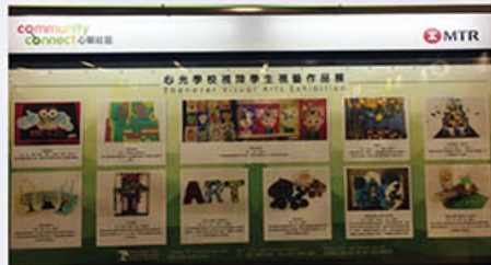
學生視藝作品於港鐵香港大學站展出 Student artworks displayed at HKU MTR Station