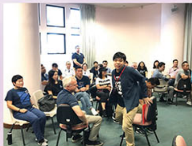
為美銀美林提供之企業培訓活動 NOIR Challenge with Bank of America Merrill Lynch