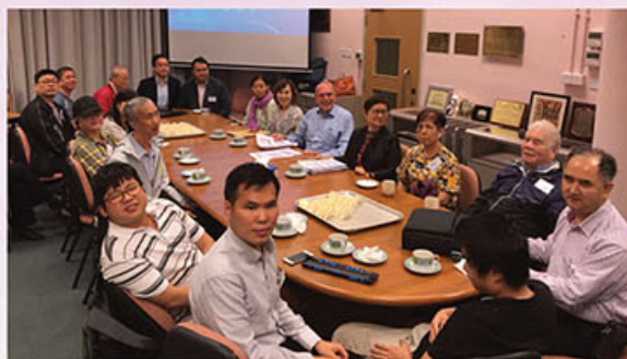
校友於董事溝通會熱烈討論 Alumni meeting with board directors