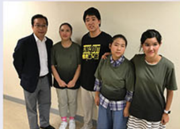
外讀生參與《奮青樂與路Sing Out》音樂劇 Integrators performing at joint-school musical