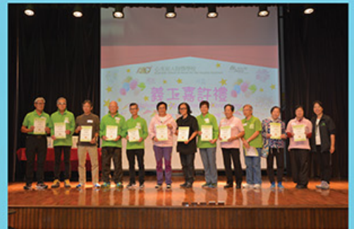
頒授感謝狀 Presentation of Appreciation Certificates