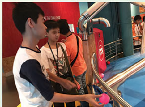
新加坡科學館探索 Exploring the Science Museum