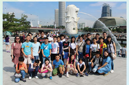
新加坡魚尾獅像合照 Visiting Merlion Park