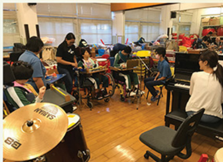
透過悠揚的音樂，音樂治療師與同學們一起互動交流 The music therapist and the students interacting through musical responses