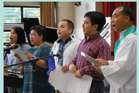
校友獻詩小組 Alumni Song Dedication Group