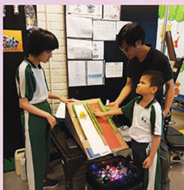
STEM探究活動—摩擦力與沿斜面滑下物體的關係 STEM experience—relationship between friction & sliding objects