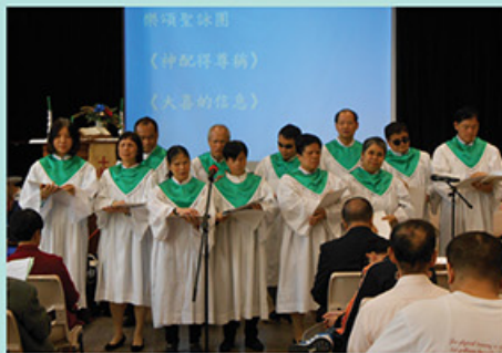
樂頌聖詠團 Cantata Choir