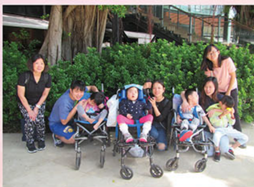
宿生赤柱一天遊 Our boarders have a nice day trip in Stanley