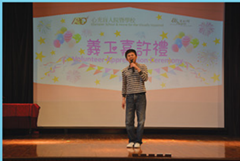
校友表演 Performance by alumnus