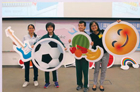
「躍動·突破」培育計劃—共融體驗活動成果分享會 Give & take sharing session of Enlivened by Breakthrough cultivating programme