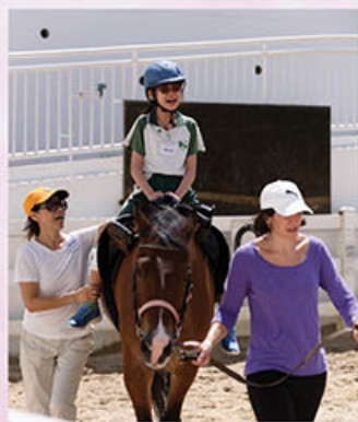
馬背上的樂趣 Horse riding fun