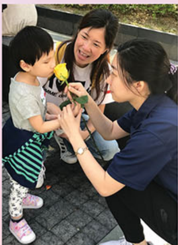
試聞花香 Smell the flower