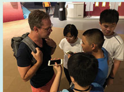
學生運用英語訪問澳洲遊客 Interviewing tourists in English