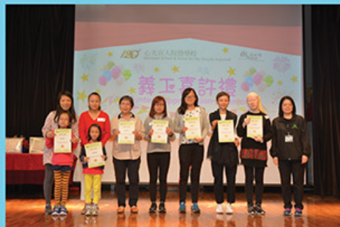
頒授感謝狀 Presentation of Appreciation Certificates