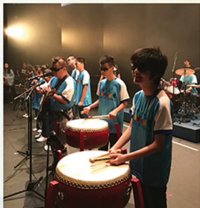
恩望兩位同學參加《藝無疆—新晉展能藝術家大匯演2017》Two students from our school participated in the "Cross All Borders 2017" competition