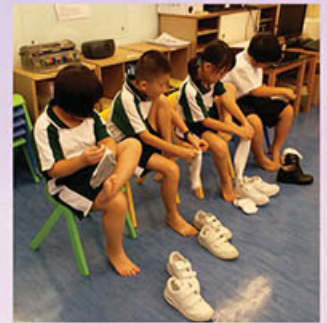
課堂生活技能 Living skill training in class