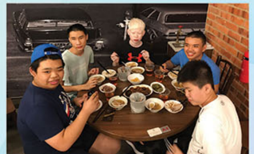
品嚐地道肉骨茶 Having Singaporean Bak Kut Teh